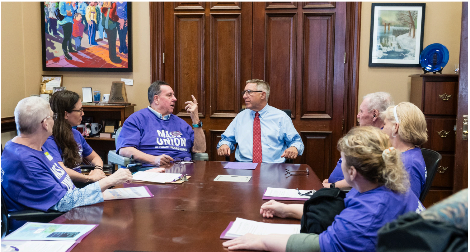
Tenant-constituents with Senator Rodrigues, Chair of the Senate Ways & Means Committee, at Public Housing Day