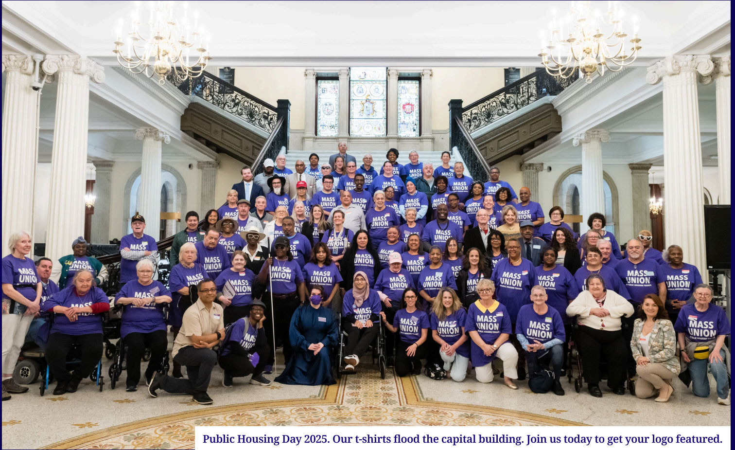
Public Housing Day 2025. Our t-shirts flooded the capital building. Join us today to get your logo featured.

Mass Union is ramping up for a big 2026! We hope you will once again support public housing tenants as we hold our two signature statewide events.