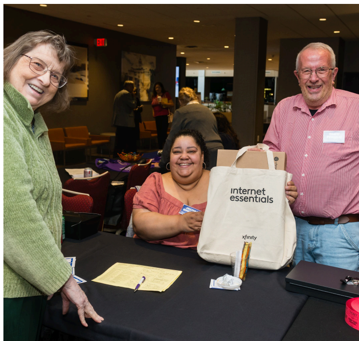
Tenants distributing free Chromebooks, courtesy of Xfinity, at the Fall 2025 Convention

Logo on event signage and swag, and on the Mass Union website, event emails and social media for both events