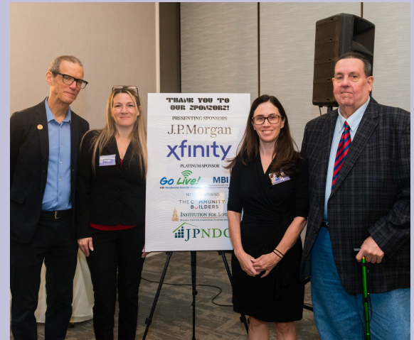
Mass Union board and staff with Senator Brownsberger at the Fall 2025 Convention

The Mass Union of Public Housing Tenants is a nonprofit run by tenants for tenants. Our mission is to build power and voice for tenants so that we may effectively improve public housing in Massachusetts. Founded by public housing residents in 1967 and incorporated in 1971, the Mass Union, a 501c3 non-profit, is the oldest statewide public housing tenants' organization in the nation.